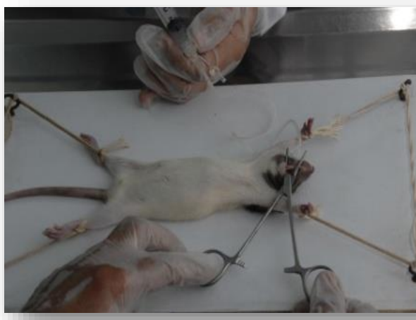
Figure 1. Oral administration of 5-FU with orogastric tube.

To produce mucosal injured intestine of rats using 5-fluorouracil by oral administration. Administration of 5-FU produces mucosal injury as well as markedly reduces absorptive and enzymatic activities of the rat small intestine 19-21 . After 24